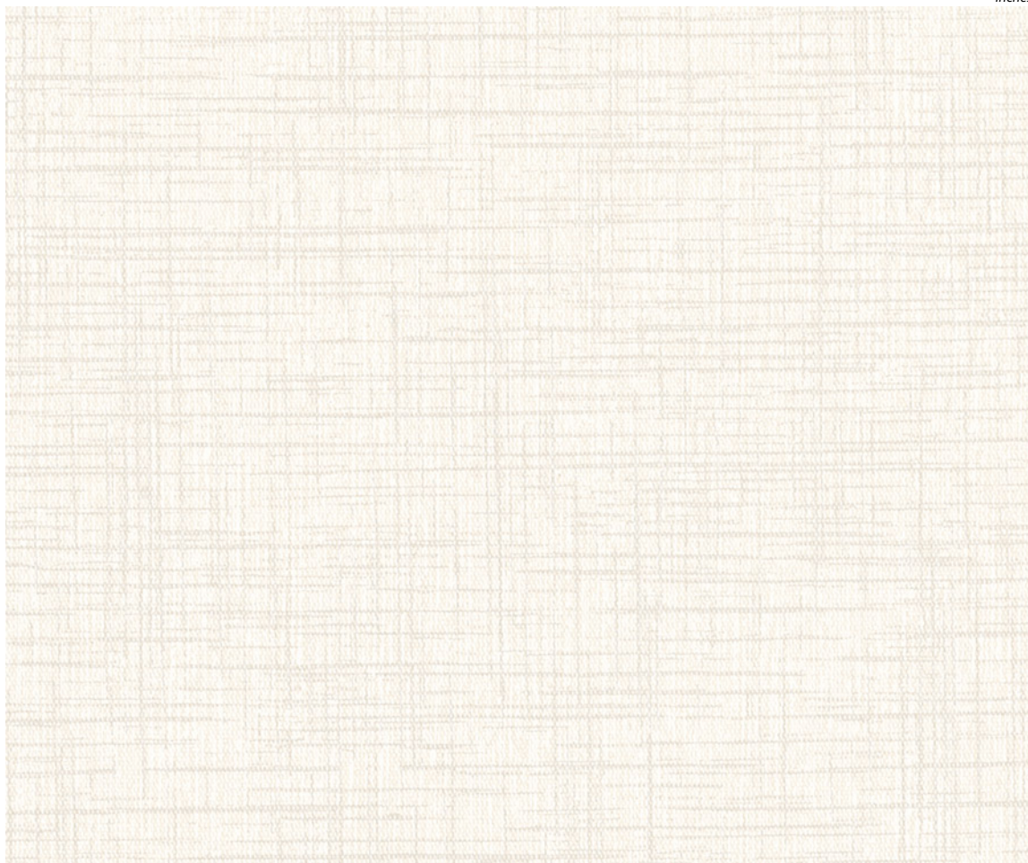
Criss Cross • Criss Cross 2.0 - CRS40 Alabaster

© 2020 C.F.Stinson, LLC. All rights reserved.